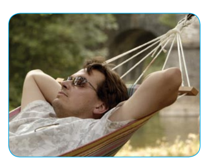
Relax! Continuous backup for all the computers in your home.